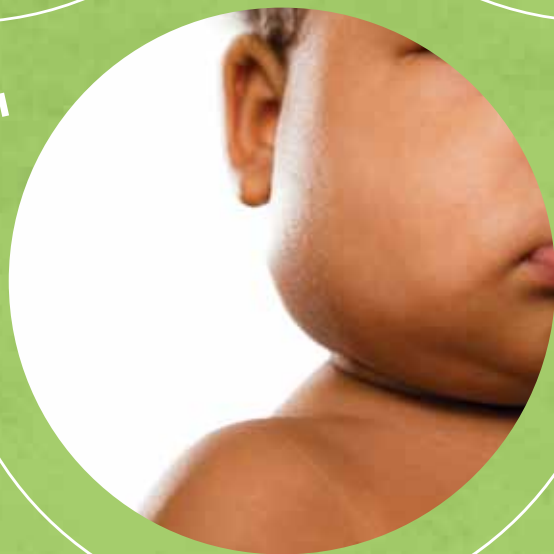
Swollen Lymph Node in Neck