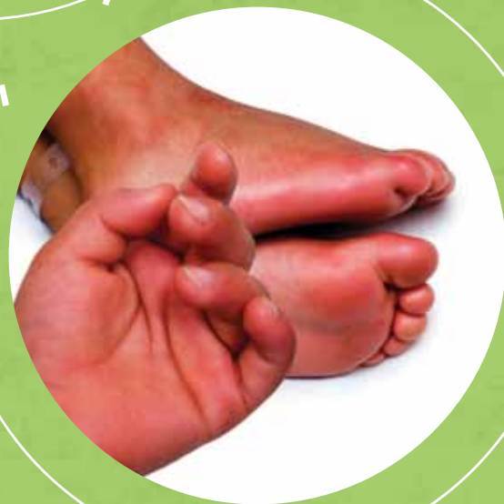
Red Palms/Soles Swollen Hands/Feet