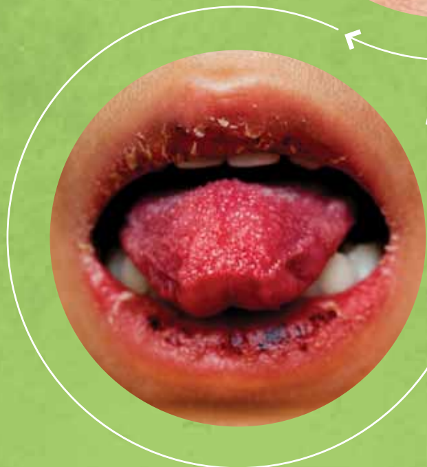
Strawberry Tongue and Red, Cracked Lips